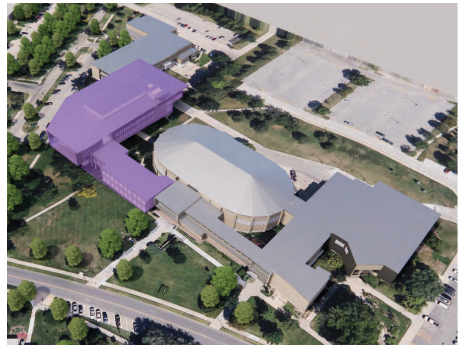
Proposed Global Center for Grain and Food Innovation.