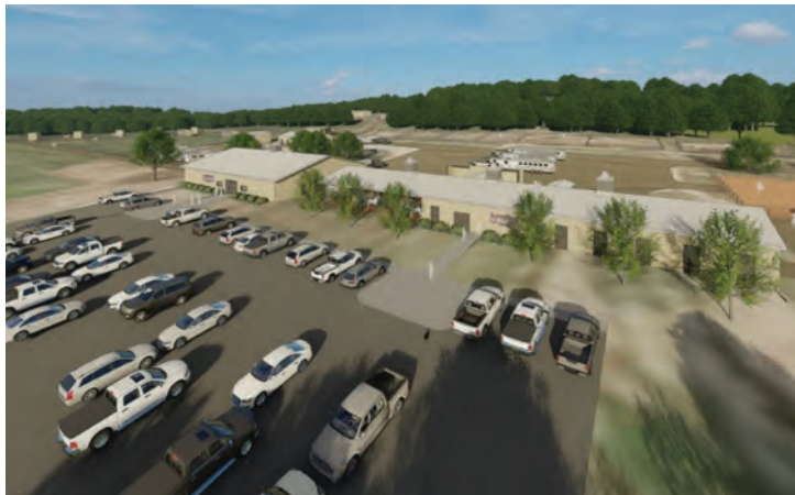
Proposed renovated Horse Unit.

A dream coming closer to reality. A project in the works for the past 20 years is making strides toward breaking ground — enhancements to the Horse Unit and the development of an Animal Science Competition Arena. The purpose of this initiative is to build a new Animal Science Competition Arena and modernize the K-State Horse Unit that supports the Department of Animal Sciences and Industry (ASI) teaching and extension efforts.