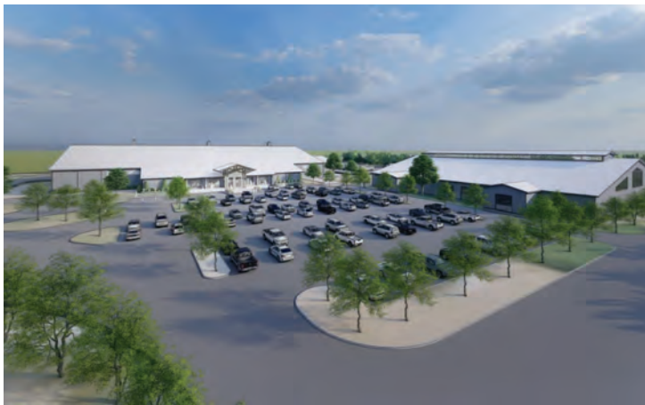
Proposed Animal Science Competition Arena that will be located adjacent to the Stanley Stout Center north of campus.